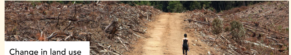
Change in land use